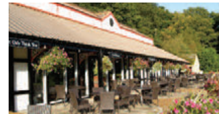
06 Cavendish Pavilion Riverside Café Restaurant