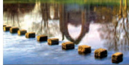
09 Stepping Stones Medieval right of way