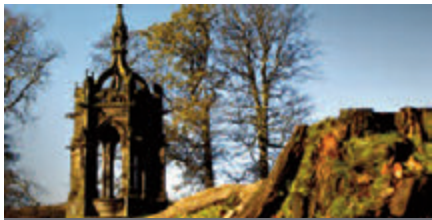
07 Memorial Fountain Commemorates Lord Frederick Cavendish