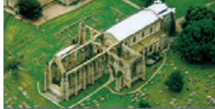
10 Priory Church & Ruins Explore. Church open daily.