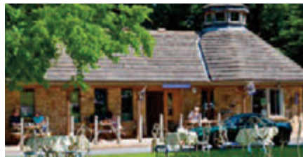
02 Strid Wood Tea Rooms Tea Rooms & Gift Shop, open daily at 9.30am