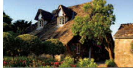
11 Tea Cottage Tea Room/Café overlooking the Priory