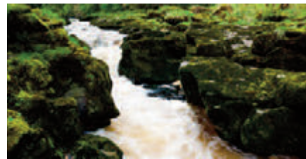
03 The Strid River Wharfe forced through narrow gorge