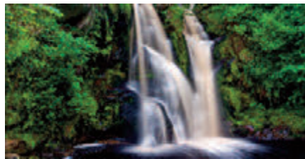
04 Valley of Desolation Follow path to Valley of Desolation & on to Simon's Seat