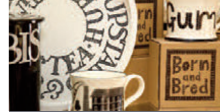
12 Village Gift Shop & Post Office Gifts, refreshments and ice creams