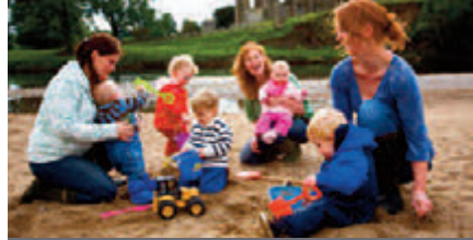
08 The Beach Ideal for picnics, sandcastles and paddling